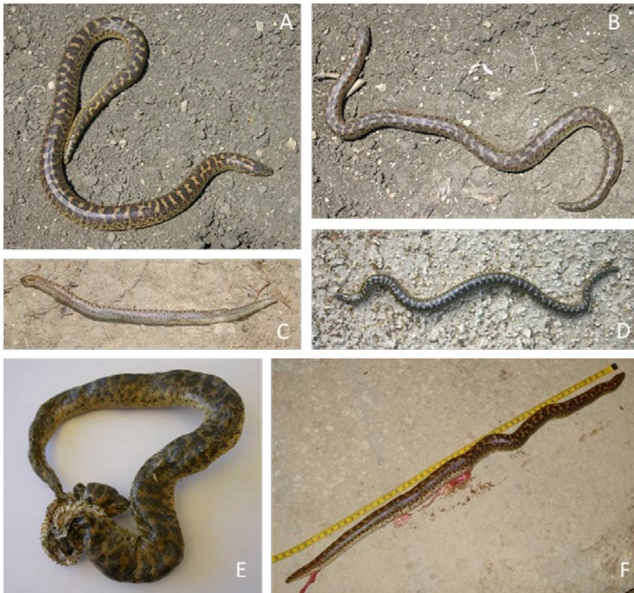
Fig. 3. Eryx jaculus founds in Licata (AG). A) male, alive in C.da Conca; B) male, alive in C.da S. F. di Paola; C) juvenile, female, drowned inside of well in C.da S. F. di Paola; D) juvenile female, alive in C.da S. Francesco di Paola; E) mummified individual in C.da Calannino; F) female, in Poggio Cuterizzio.

which has 3 PIN scales, is considered within the intraspecific variability (Boulenger, 1913; Tokar and Obst, 1993).