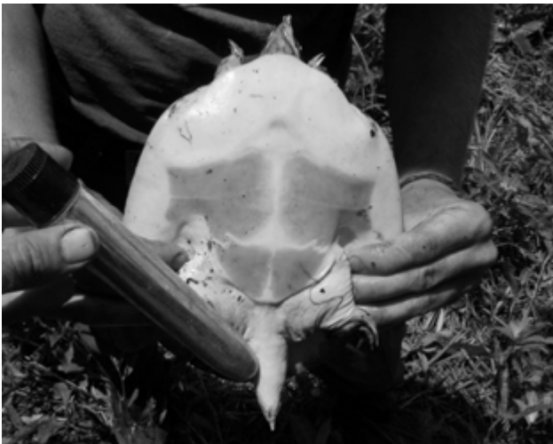
Fig. 1. A male spiny softshell turtle ( Apalone spinifera ) being vibrated on the tail.

Once a male turtle was captured, we attempted to induce an erection by applying an 18 cm, variable-speed, silver bullet vibrator to its shell and tail. We vibrated turtles for 10 min or until an erection was achieved, and we recorded the amount of time that it took to induce an erection. Trials were scored as “unsuccessful” if an erection had not been induced by the end of the 10-minute trial period. Our preliminary trials indicated that turtles needed to be fairly relaxed and willing to extend their limbs and tails before the method would be effective. Therefore, for the sake of time, we limited our trials